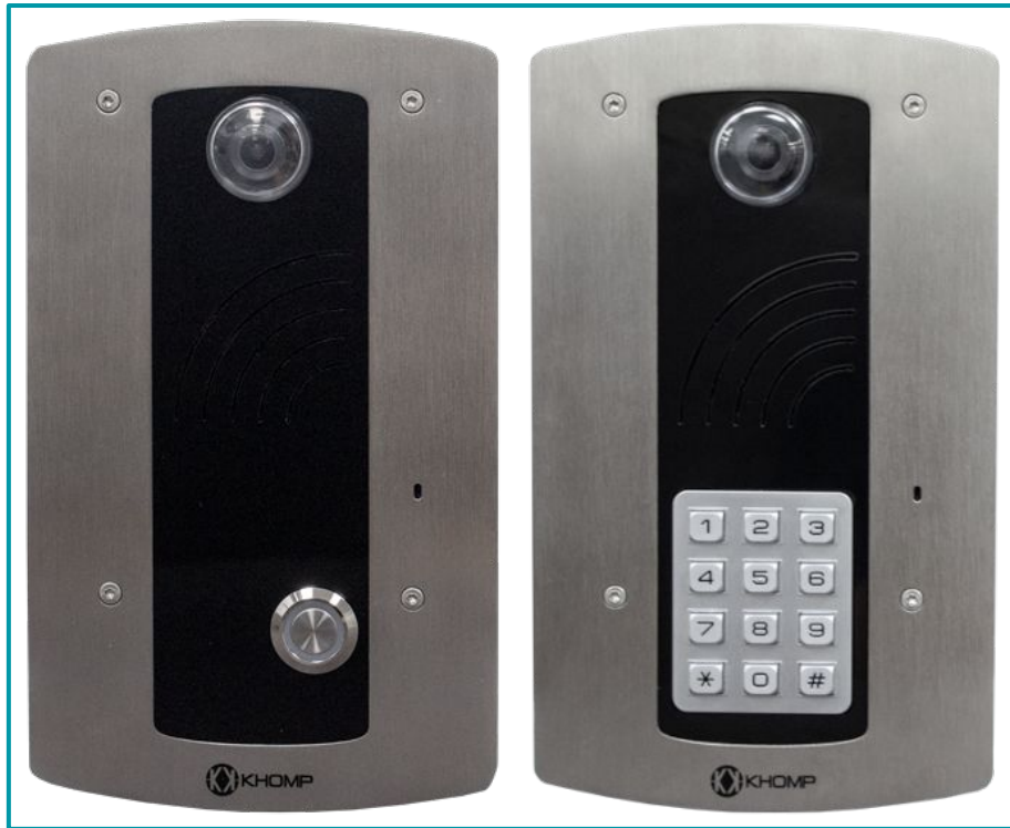
Subtitle: Front of the IP Wall 301 S, IP Wall 301 SR and IP Wall 312 S models.