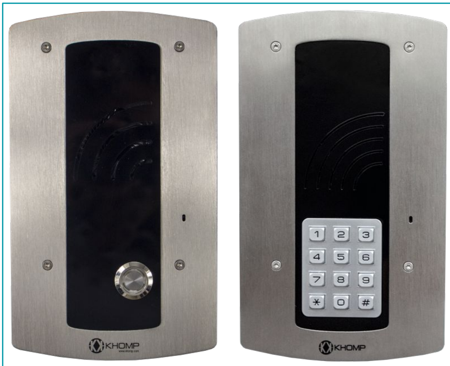
Subtitle: Front of the IP Wall 301 S and IP Wall 312 S models.