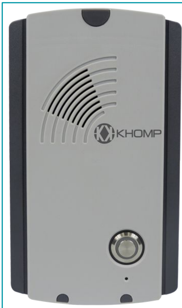
Subtitle: Model IP Wall 201 BC - R (with RFID reader).