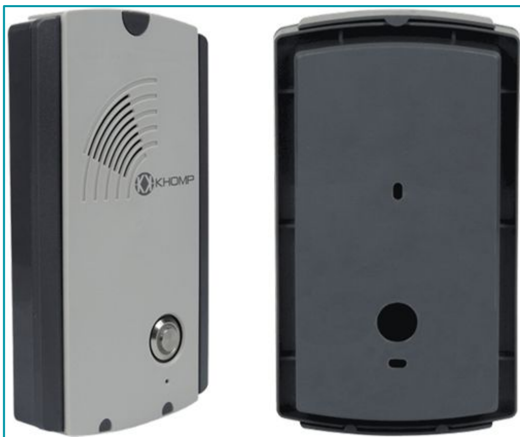
Subtitle: Model IP Wall 201 BC (double sided).