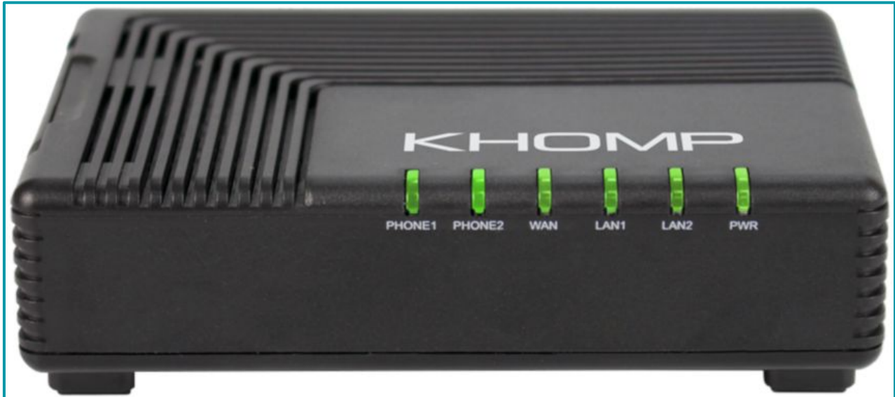
Front view with indicator LEDs.