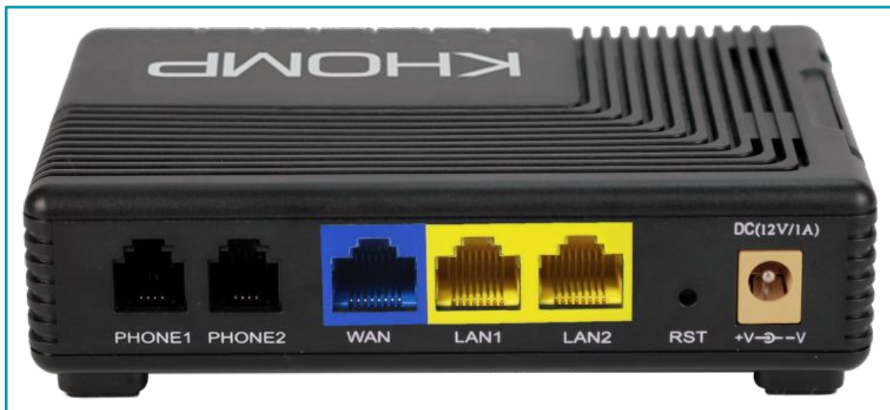
Rear view with FXS ports, WAN and LAN ports, reset button and power supply input.